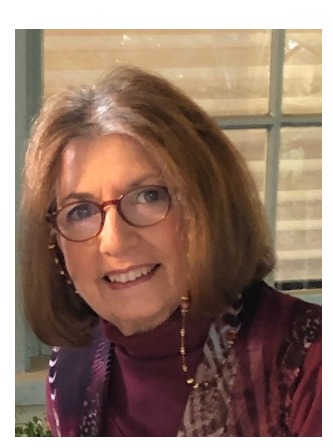
Ginny Hatfield Public Policy Committee