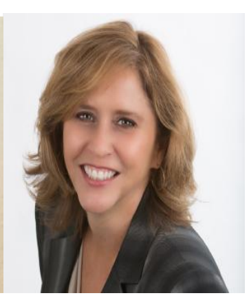
Osten Legislative Advocate