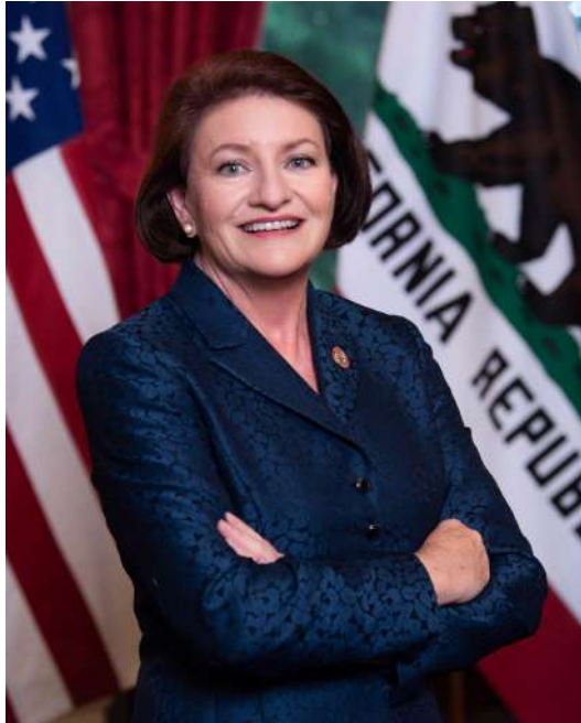
Senator Toni Atkins