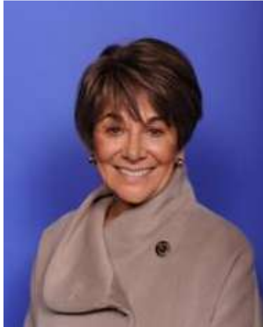
Congresswoman Anna Eshoo