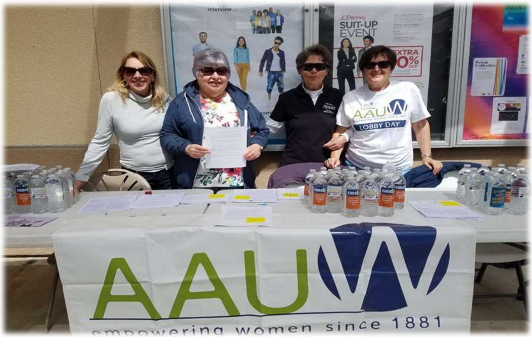
Members from COV Public Policy Committee table at Mira Costa College for Equal Pay Day