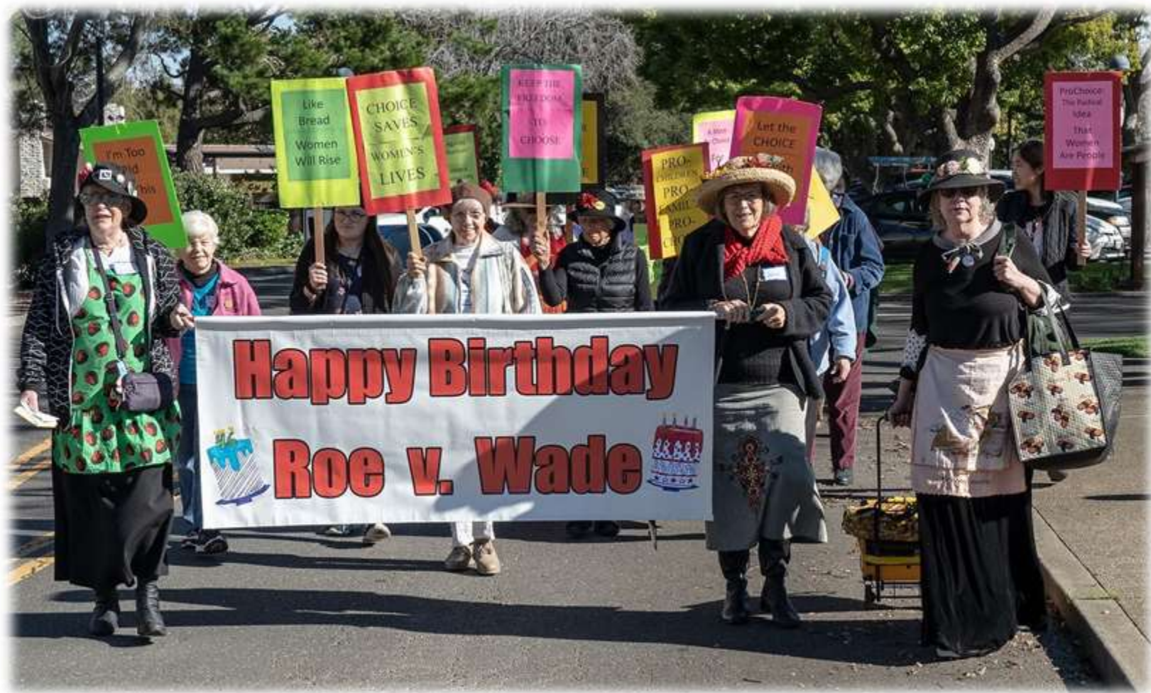
Los Altos-Mountain View Branch Annual Reproductive Freedom March