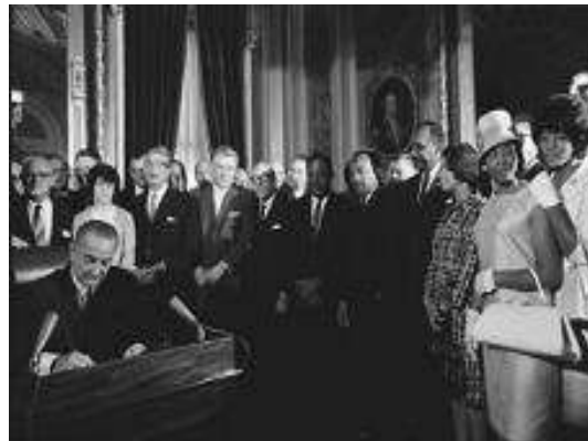
The Voting Rights Act of 1965