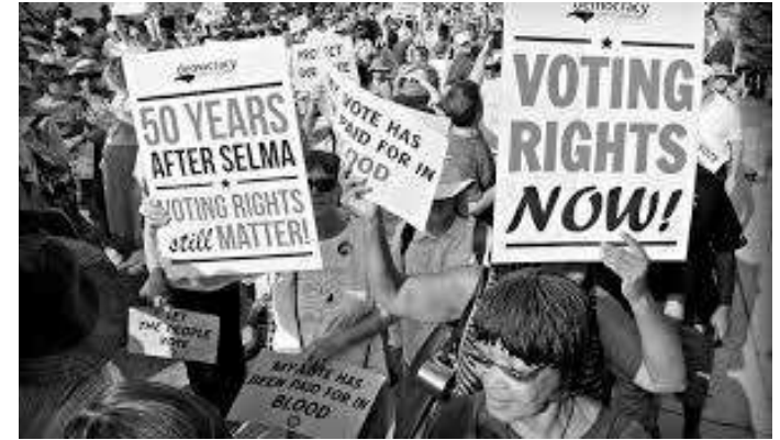
The 1975 Amendment to the VRA