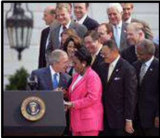
Fannie Lou Hammer, Rosa Parks, and Coretta Scott King Reauthorization and Amendments of 2006