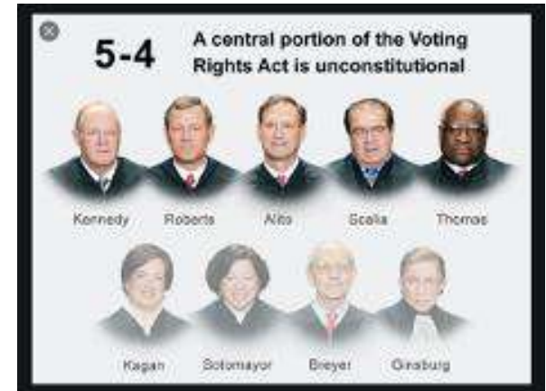
The Supreme Court decides Shelby v Holder in 2013

Voting Rights Advancement Act of 2019 (H.R. 4 / S. 561) soon to be named for John Lewis