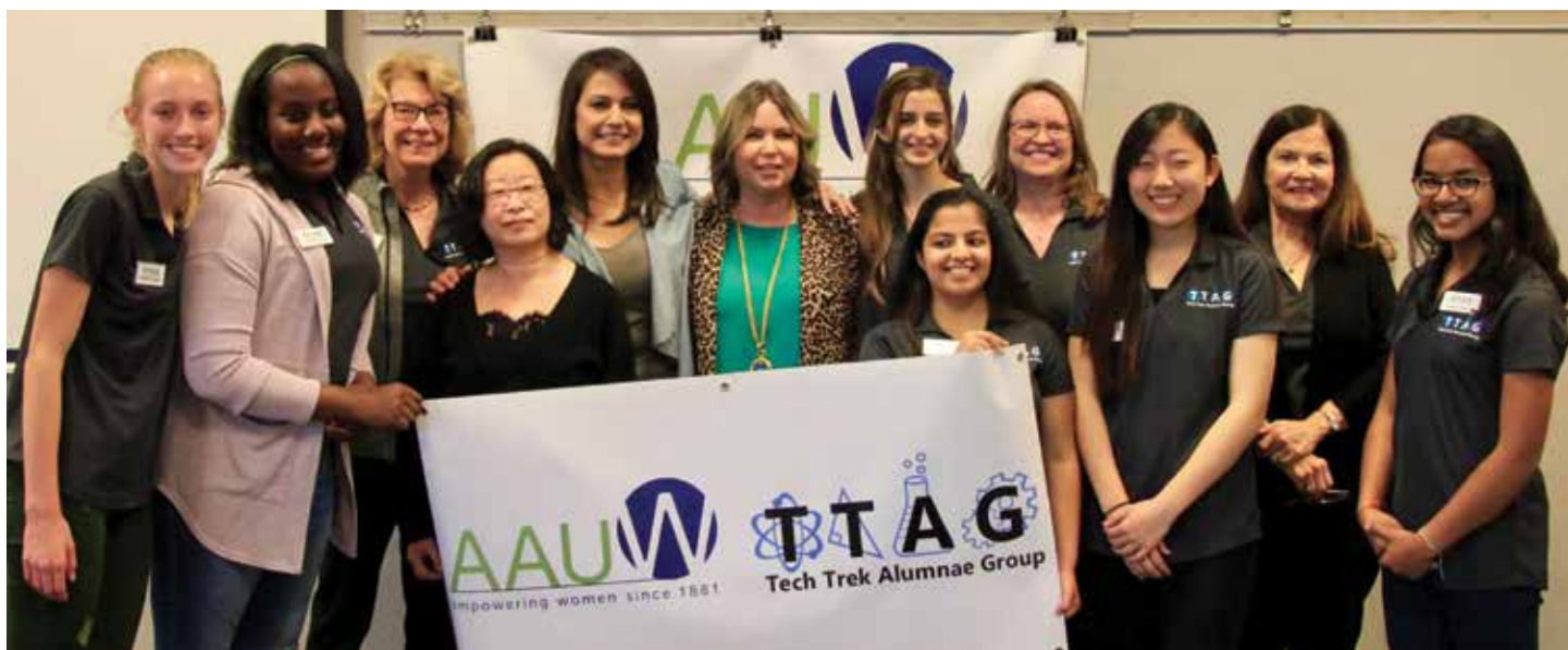
TTAG committee with the presenters.