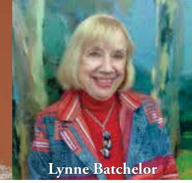
San Diego Branch Secretary 2018-20 Project Oversight