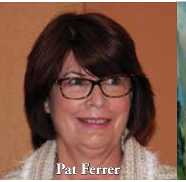
Long Beach Branch Chief Financial Officer 2017-19 Finance