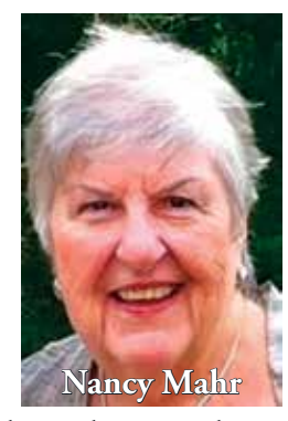
Palos Verdes Peninsula Branch Director 2017-19 Public Policy