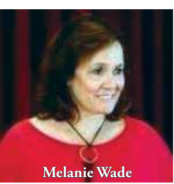
Danville-Alamo-Walnut Creek Branch Director 2018-20 Communications