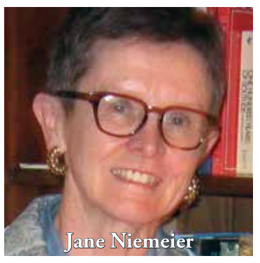
La Mesa- El Cajon and San Diego Branches Co-President 2018-20 Executive (co)