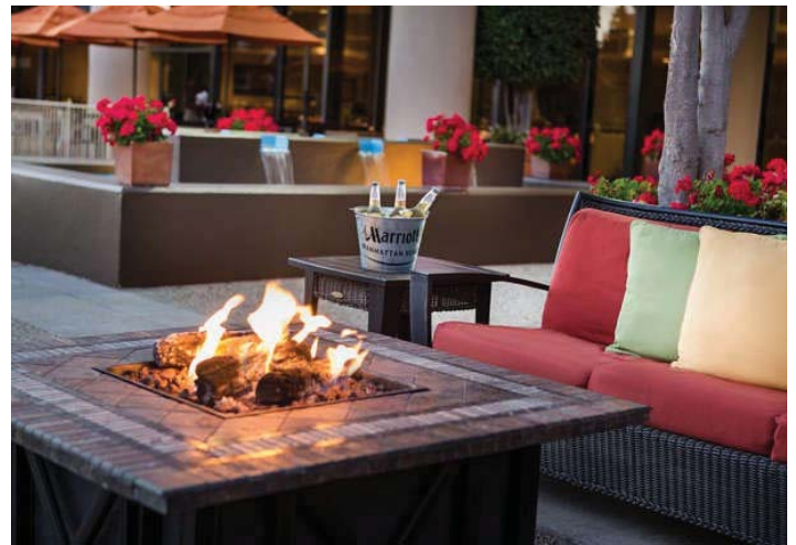
Come join us here at the Manhattan Beach Marriott