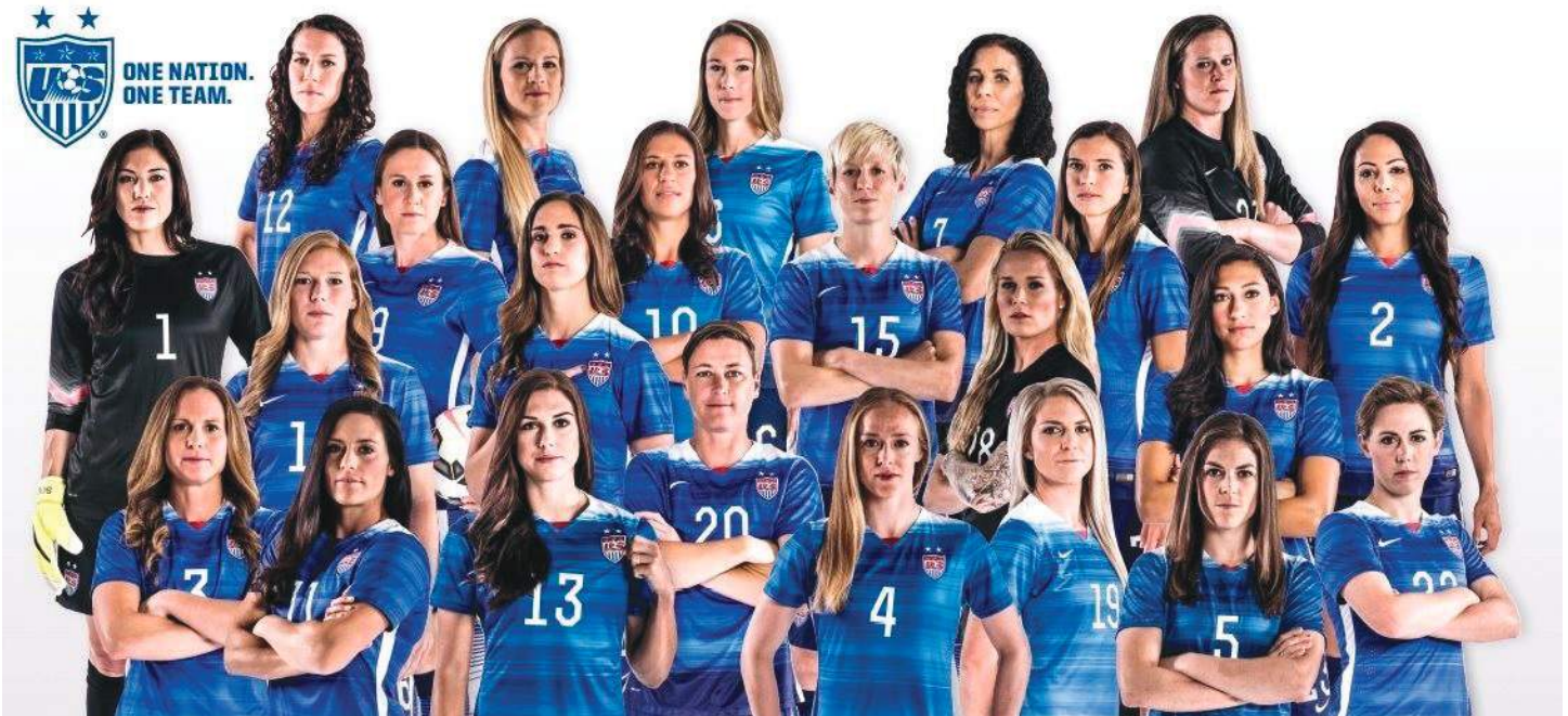
U.S. women's national soccer team.