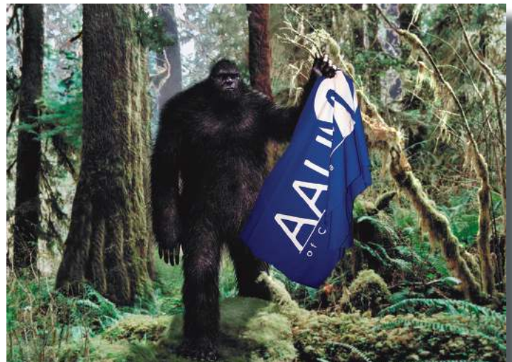
This undated picture appears to show the tablecloth being recovered somewhere in the Pacific Northwest.