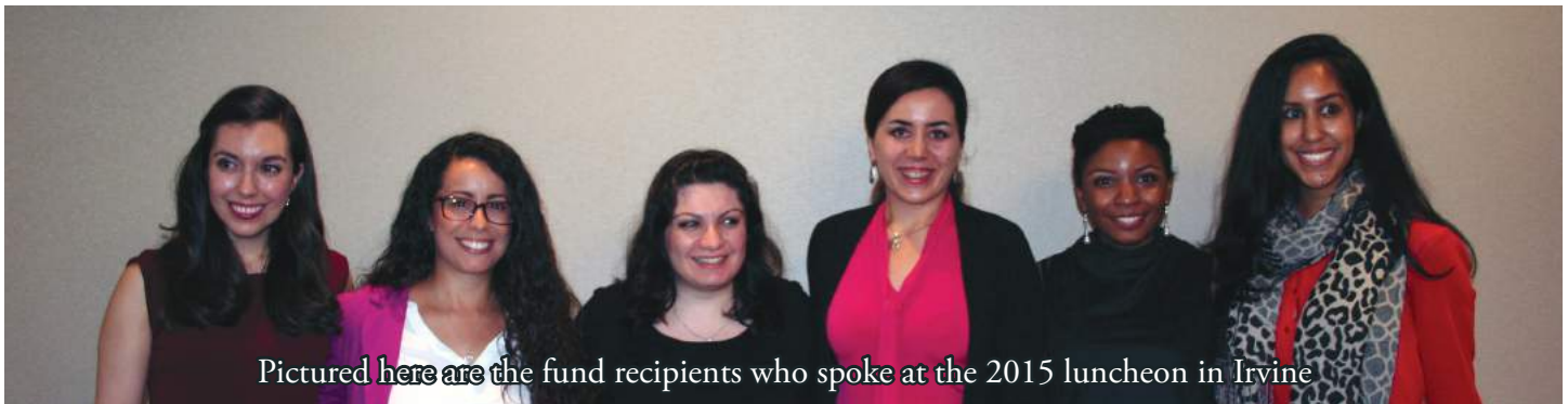
Pictured here are the fund recipients who spoke at the 2015 luncheon in Irvine

Crow Canyon Country Club 711 Silver Lake Drive Danville, CA 94526