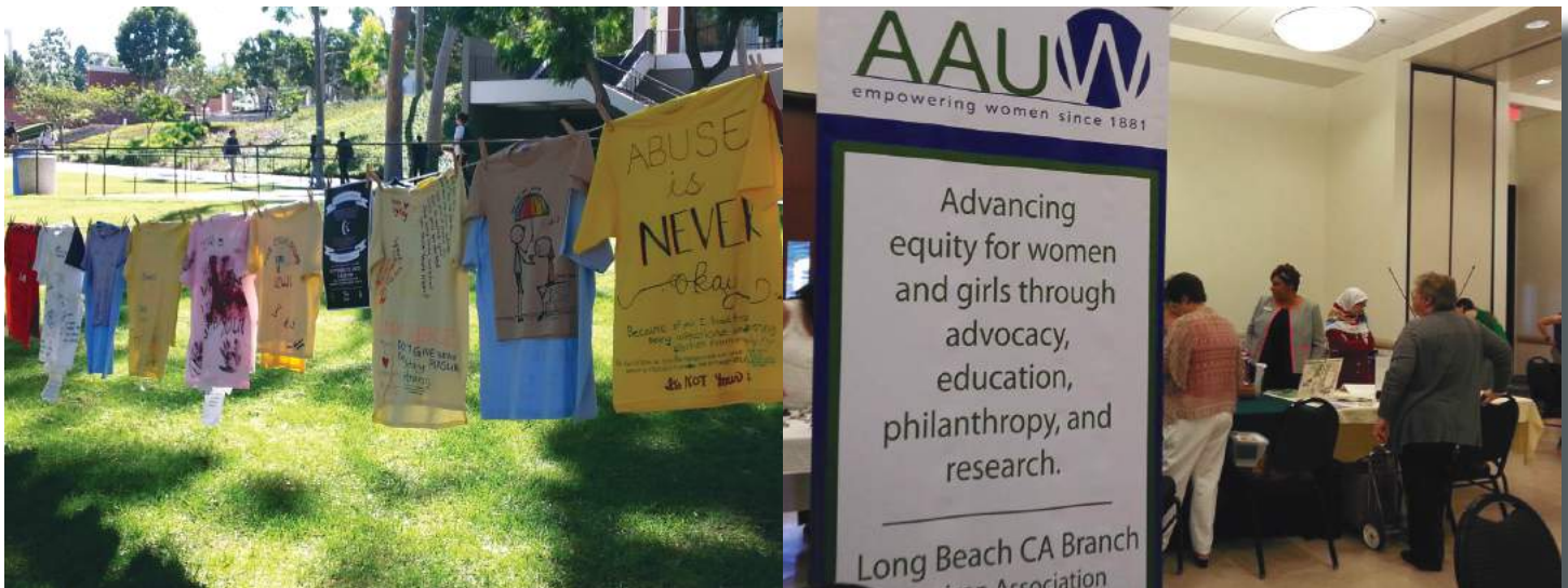
Clothesline Project at California State University Long beach

AAUW CA's Membership Team is committed to increasing branch involvement in the community thereby increasing the reach of AAUW's mission. If you or your branch has an idea or story to share on the retention and recruitment of new members, please let us know!