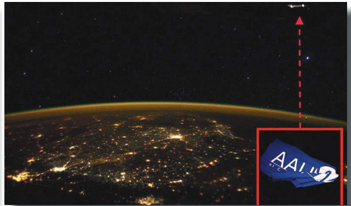
Some believe a photo taken from the international space station over India by Scott Kelly on November 15, 2015 shows the tablecloth in near-Earth orbit.

What we can be sure of is that Tina Byrne played a key role in its return and deserves our thanks.