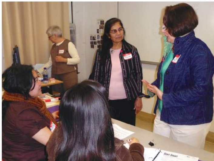
Our first $tart $mart workshop was at Las Positas College in Livermore on May 15, 2010

Programs like $tart $mart are an excellent addition to our financial literacy portfolio. Both as a recipient of a AAUW Community Action Grant for $tart $mart and as an initiator in bringing this program to AAUW CA, I am grateful to many leaders who presented and are still diligently presenting those workshops, and I am grateful to countless other members who helped with many other tasks. I want to thank each and every one of them for the excellent work they are still doing.