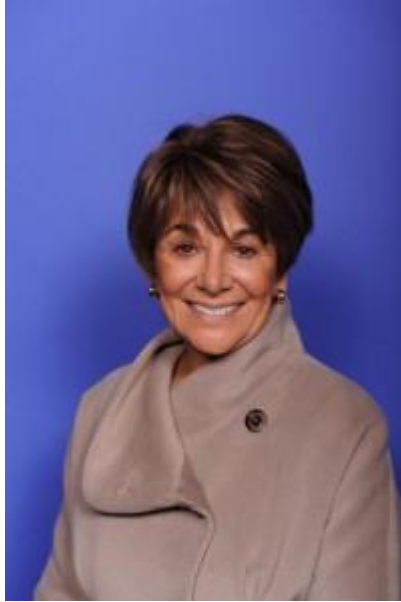
Congresswoman Anna Eshoo