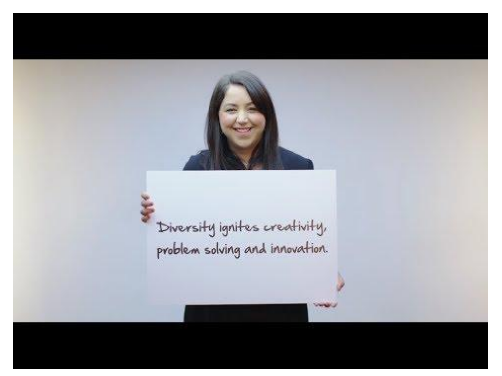
-Video by <u>Accenture</u>