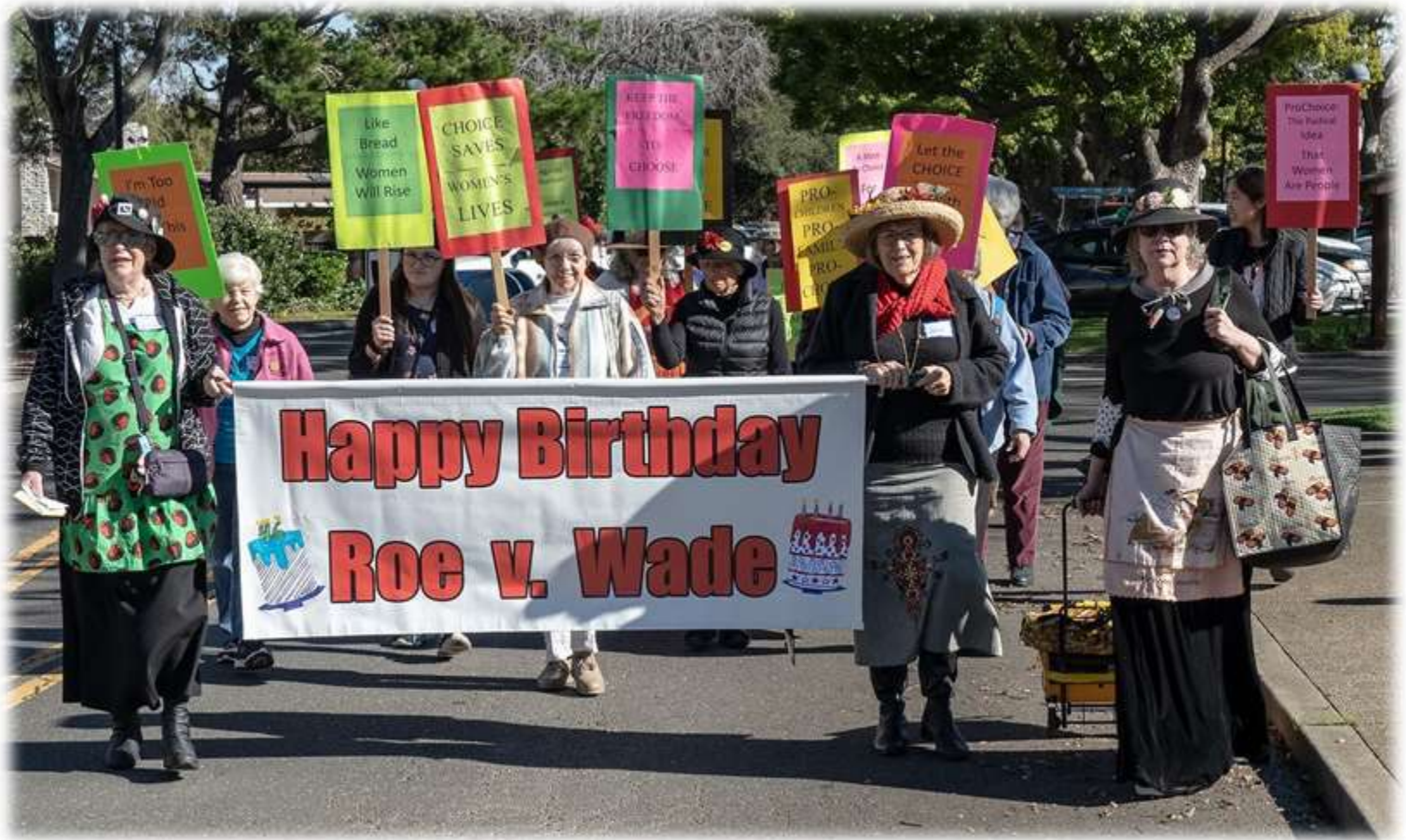
Los Altos-Mountain View Branch Annual Reproductive Freedom March