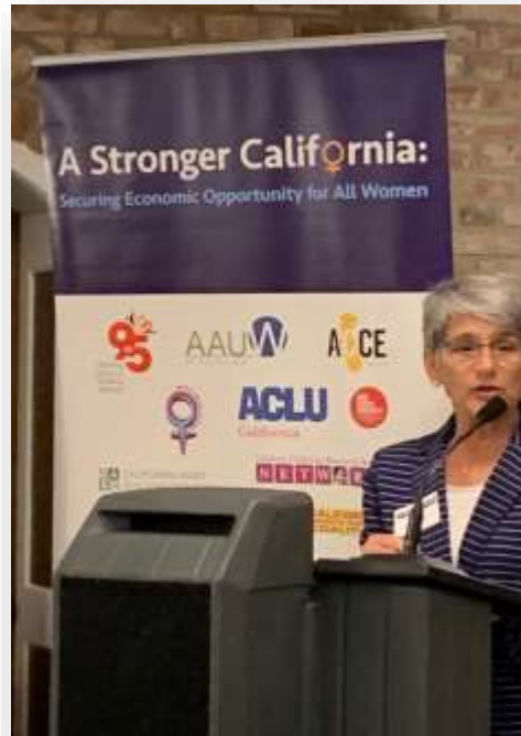
Senator Hannah-Beth Jackson, a true champion of women's rights