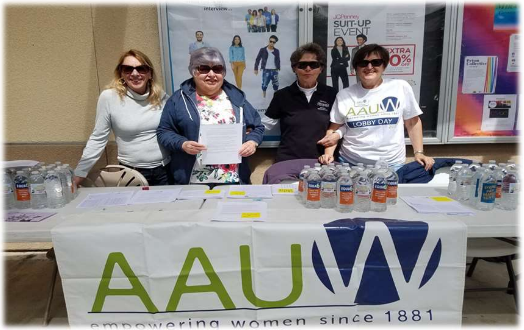
Members from COV Public Policy Committee table at Mira Costa College for Equal Pay Day