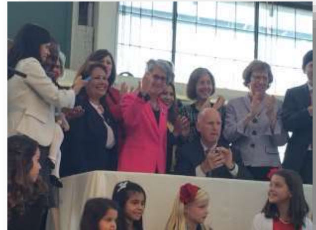
Gov Brown signs the California Equal Pay Act with members of the CA Women's Caucus