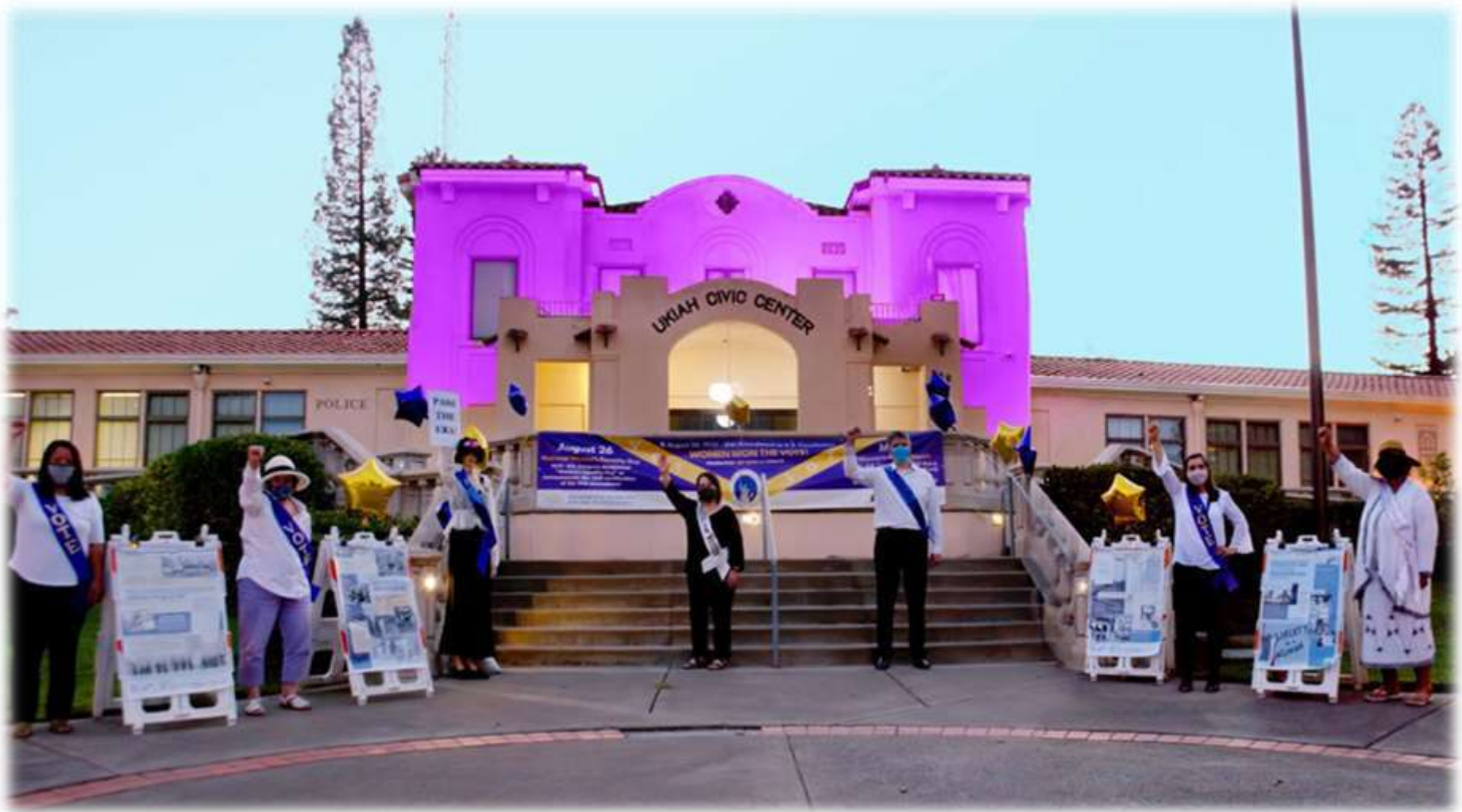
Ukiah Branch Celebrates the 100th Anniversary of the ratification of the 19th Amendment