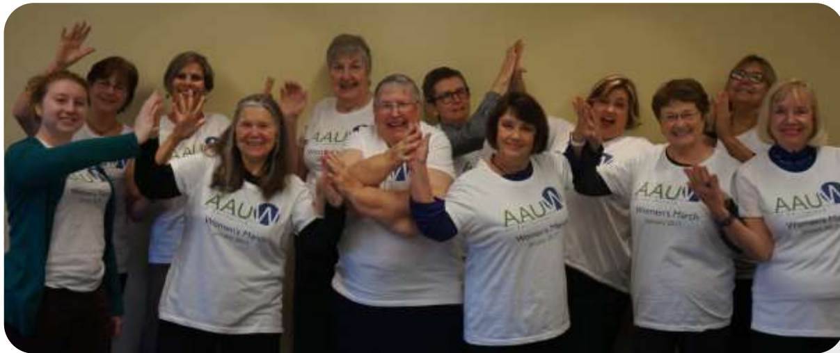
Members from COV branch, Danville-Alamo-Walnut Creek, and the 2017 AAUW California Board participate in the Women's March