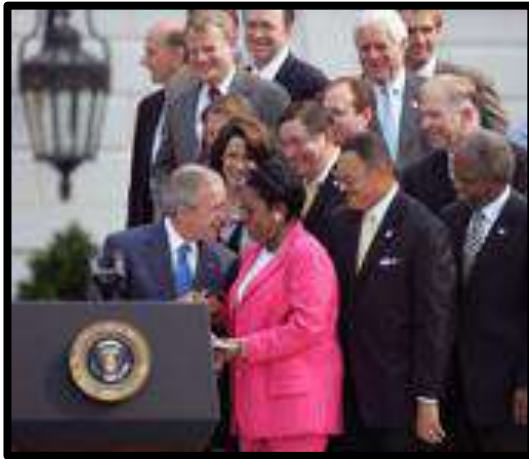
Fannie Lou Hamer, Rosa Parks, and Coretta Scott King Reauthorization and Amendments of 2006