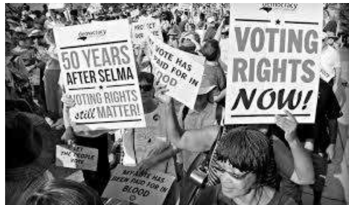
The 1975 Amendment to the VRA