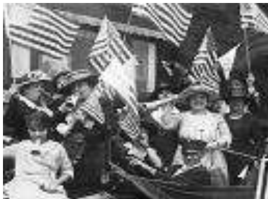
The 19th Amendment of 1920