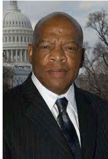
Voting Rights Advancement Act of 2019 (H.R. 4 / S. 561) soon to be named for John Lewis