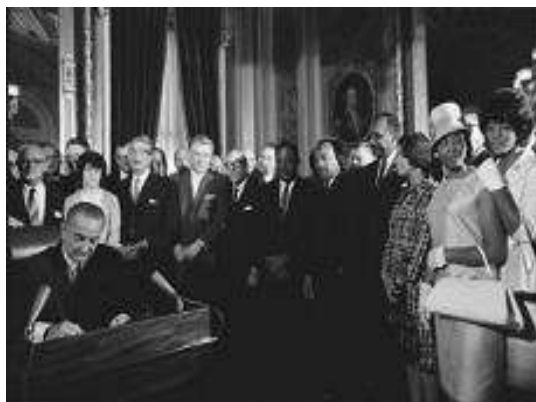
The Voting Rights Act of 1965