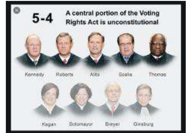
The Supreme Court decides Shelby v Holder in 2013