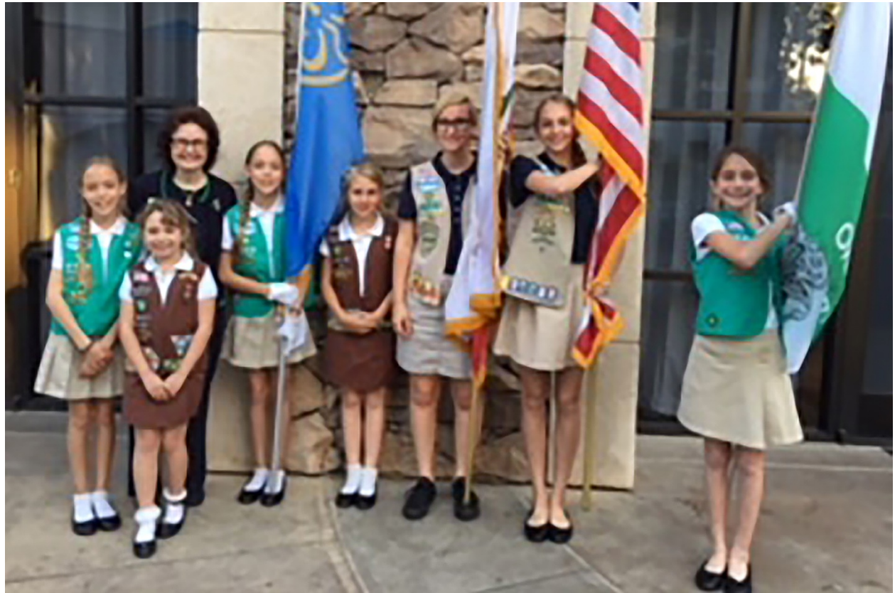
The Yorba Linda Girl Scout Honor Guard opened the Friday night business session.

Branch Anniversaries Committee Reports Special Reports Branch Recognition