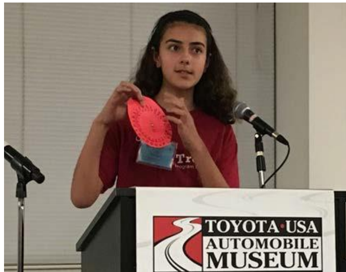
STEM -Tech Trek Member 2016, Torrance Branch