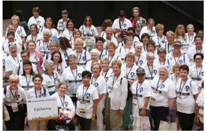
Public Policy Plenary

Please note that registration for this event is separate from the package deals. See Thinking Outside the Package - Meal Events to register.