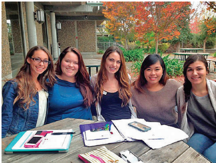
Napa Valley Community College CAP Grant Awardees

Additionally, you can now train new and potential leaders through our “job-alike videos” – President (small & large boards), (non-traditional boards), Programs, Secretary, and Treasurer. These videos may even help you to decide to take a leadership position, not only in your branch, but also on the state and national committees. These videos will be on aauw-ca.org soon. For more information, please contact leaderdev@aauw-ca.org .