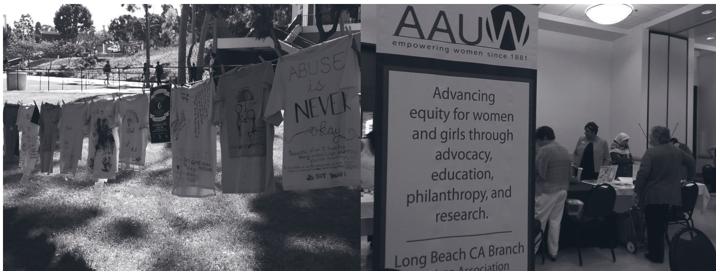
Clothesline Project at California State University Long beach

AAUW CA's Membership Team is committed to increasing branch involvement in the community thereby increasing the reach of AAUW's mission. If you or your branch has an idea or story to share on the retention and recruitment of new members, please let us know!