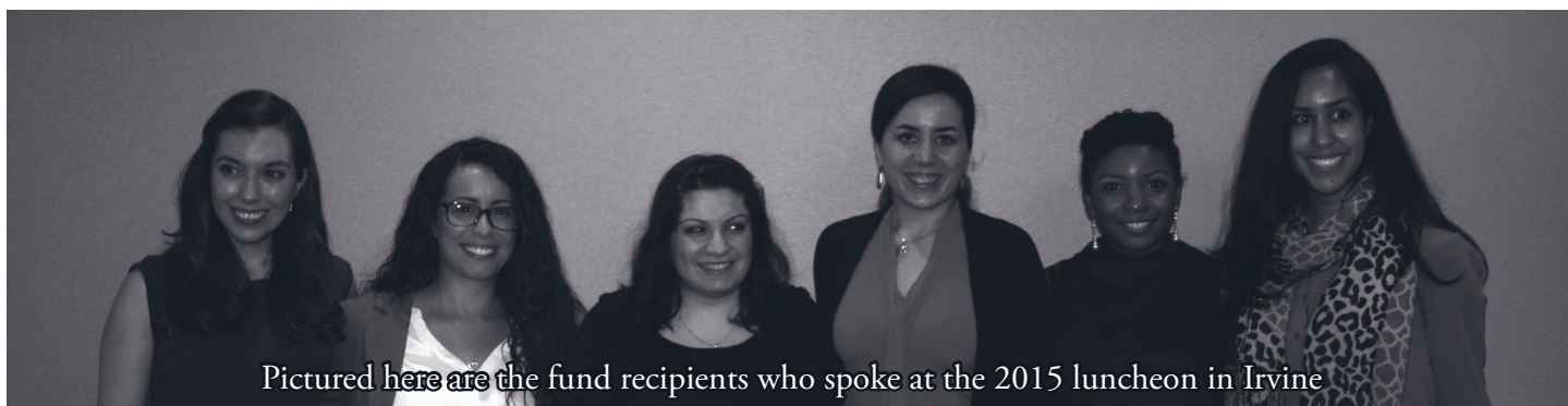
Pictured here are the fund recipients who spoke at the 2015 luncheon in Irvine