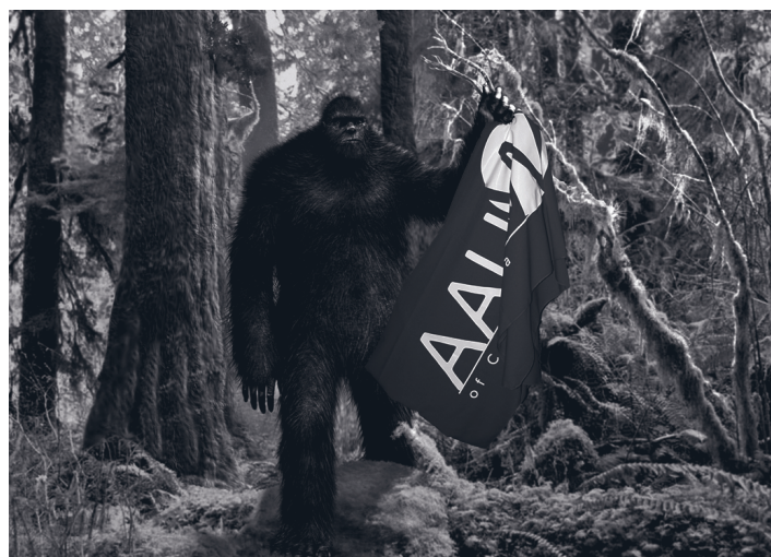
This undated picture appears to show the tablecloth being recovered somewhere in the Pacific Northwest. (photo adapted from http://leveledmag.com/2012/08/top-5-proofs-that-bigfoot-exists/ )