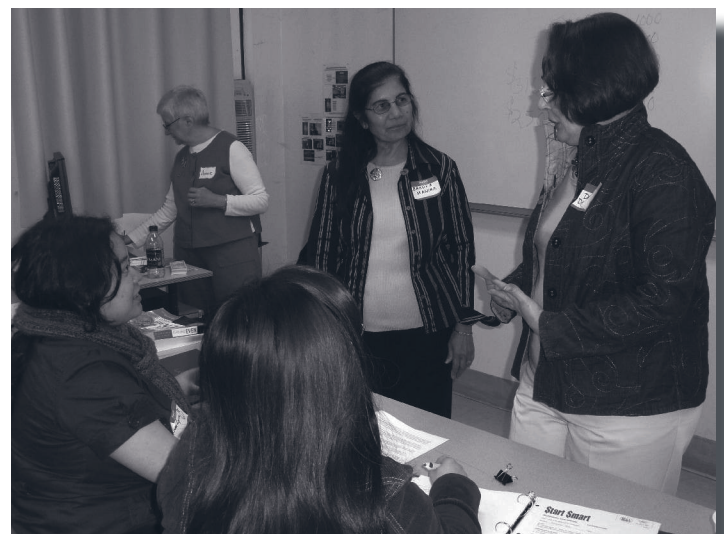
Our first $tart $mart workshop was at Las Positas College in Livermore on May 15, 2010

Programs like $tart $mart are an excellent addition to our financial literacy portfolio. Both as a recipient of a AAUW Community Action Grant for $tart $mart and as an initiator in bringing this program to AAUW CA, I am grateful to many leaders who presented and are still diligently presenting those workshops, and I am grateful to countless other members who helped with many other tasks. I want to thank each and every one of them for the excellent work they are still doing.