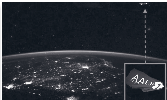
Some believe a photo taken from the international space station over India by Scott Kelly on November 15, 2015 shows the tablecloth in near-Earth orbit.

What we can be sure of is that Tina Byrne played a key role in its return and deserves our thanks.